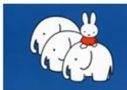
MIFFY Logo Copyright